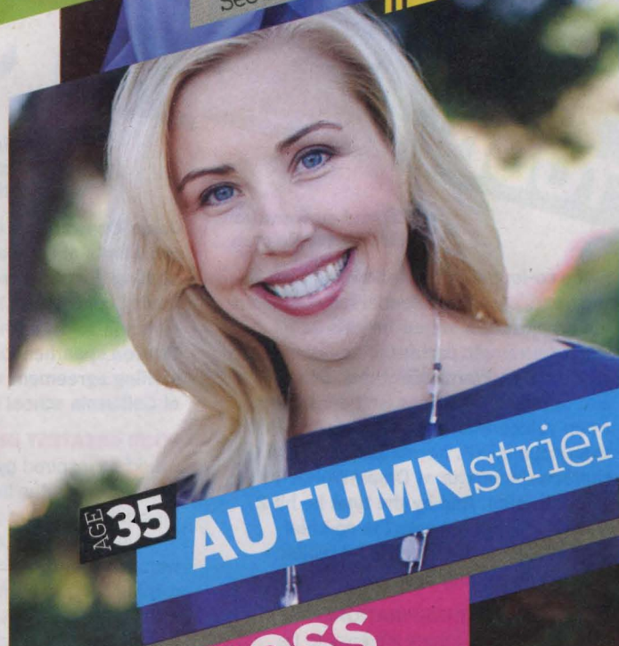
AGE 35 AUTUMN strier

See some of these biz stars on video at ocmetro.com